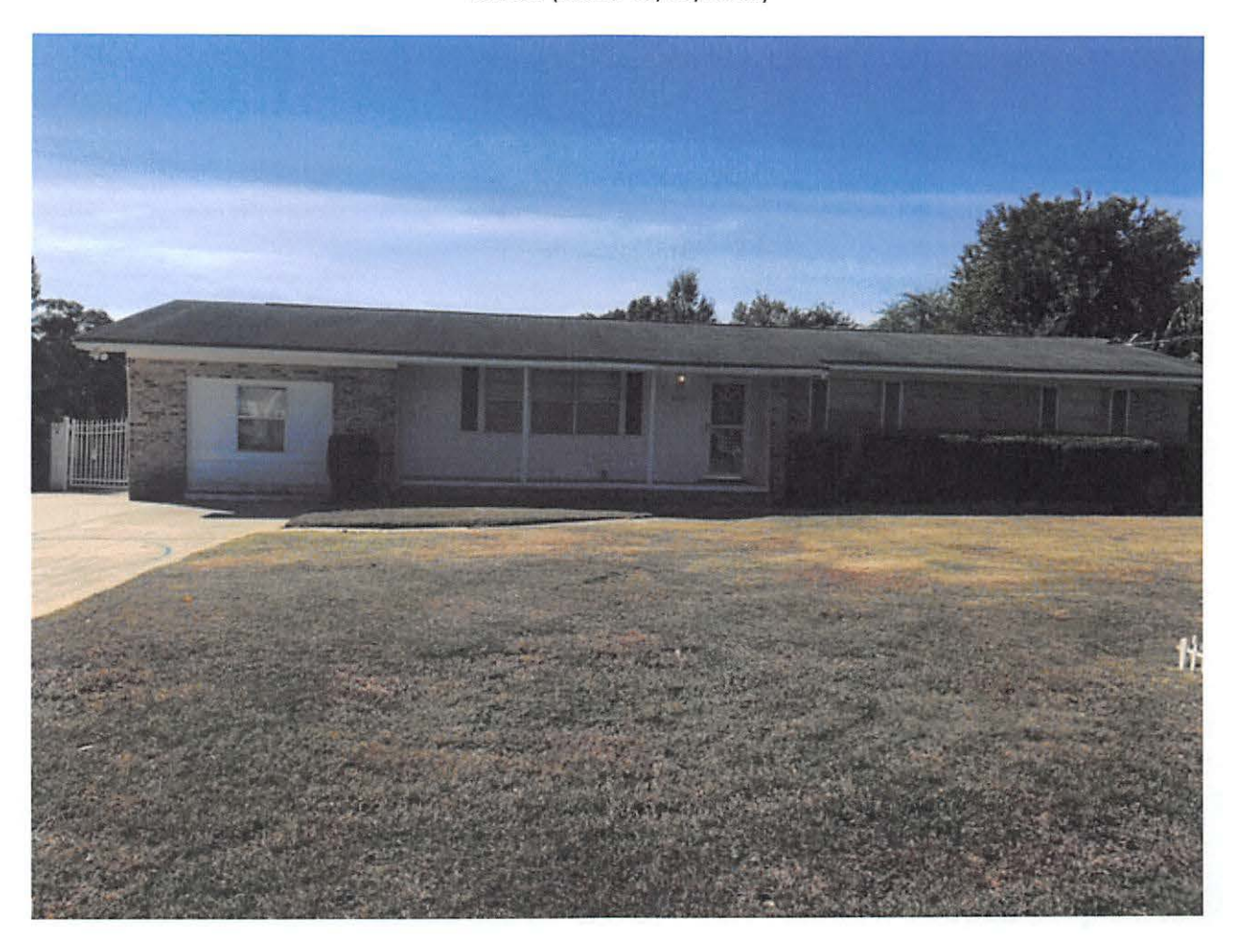
Replacement Roof 6214 Vicksburg Drive – Wanda Woods and Freddie L. Woods