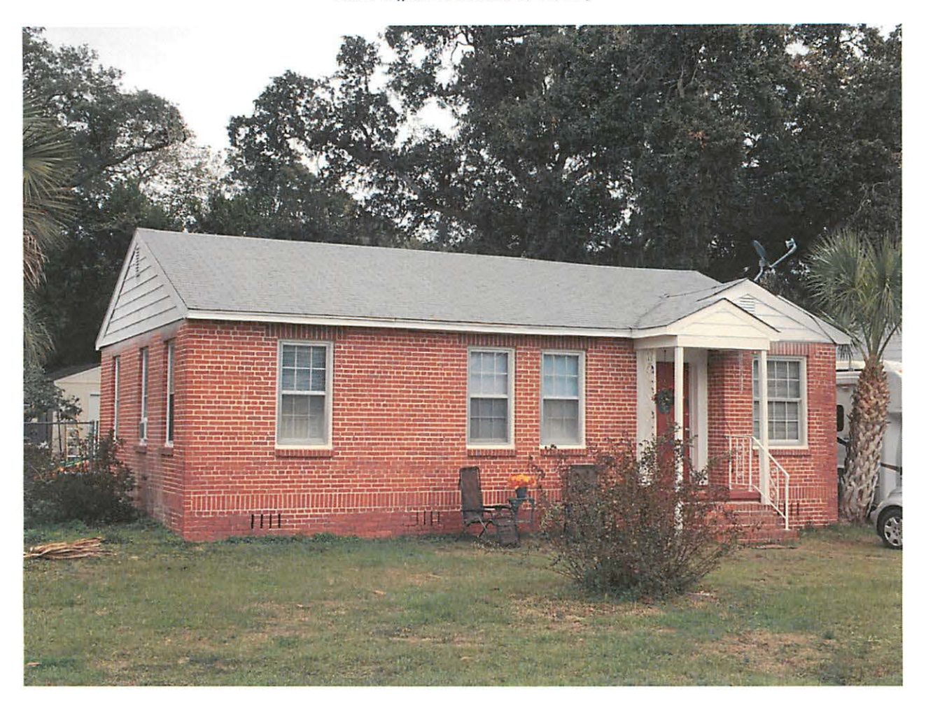
Replacement roof 16 Northwest Gilliland Road – Kenneth and Suzanne Staruk