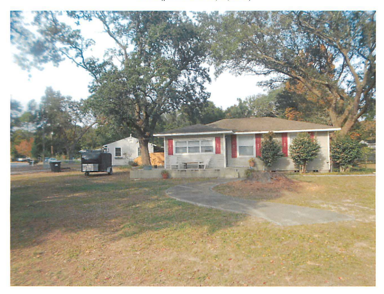
Replacement roof 202 Edgewater Drive – Loice B. Jackson