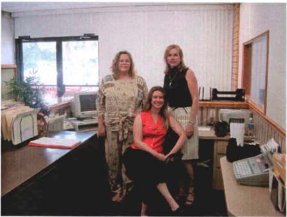
Resources and Staff to get the job done