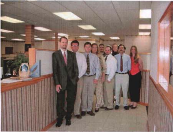
Commercial Appraisal Department